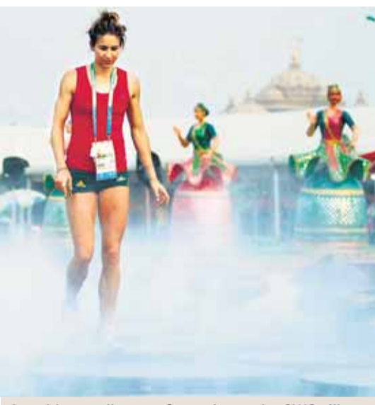
An athlete walks past fountains at the CWG village on Saturday